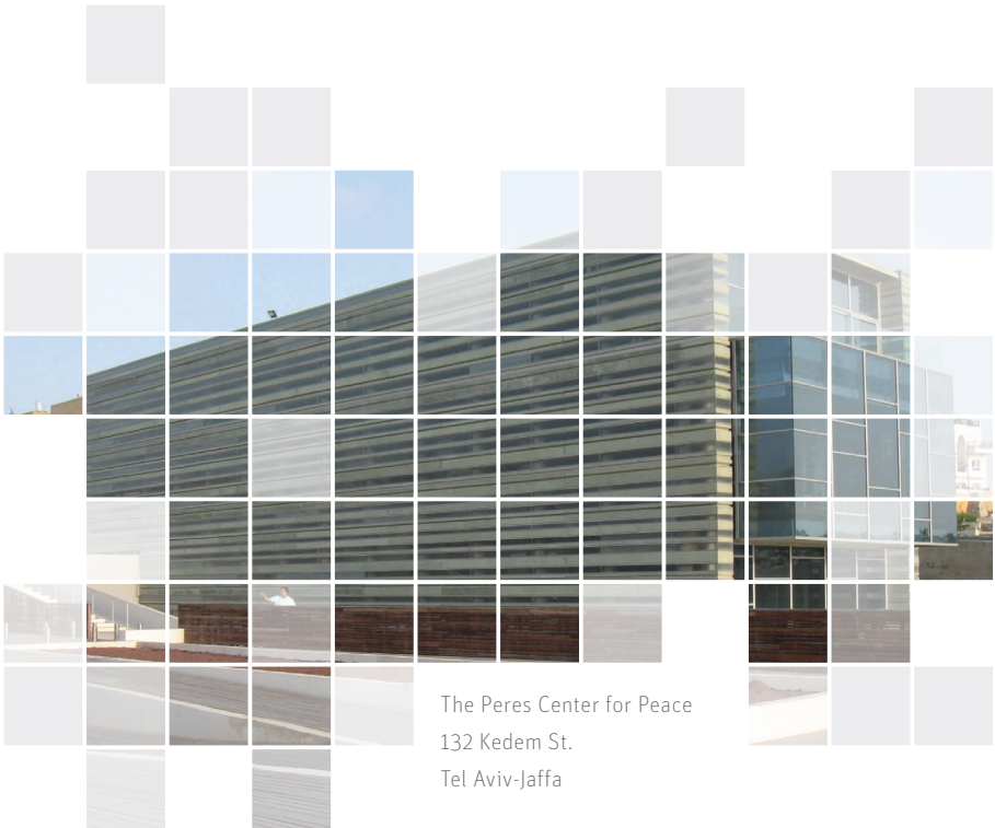
The Peres Center for Peace 132 Kedem St. Tel Aviv-Jaffa